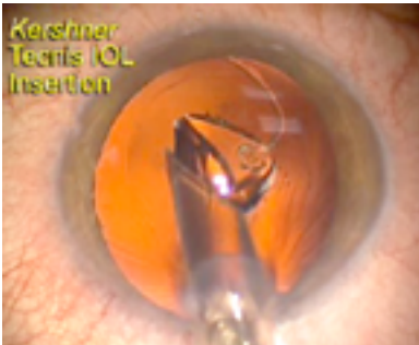
Fig. 4 Healon 5 injected into the center of the capsulorrhexis aids in IOL insertion.