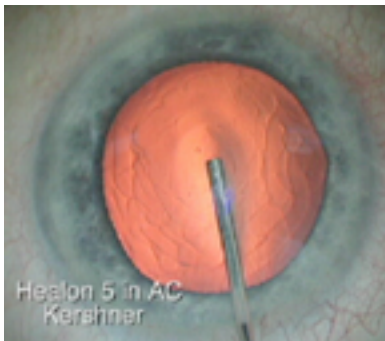
Fig. 2 Healon 5 deepens the anterior chamber for capsulorrhexis.